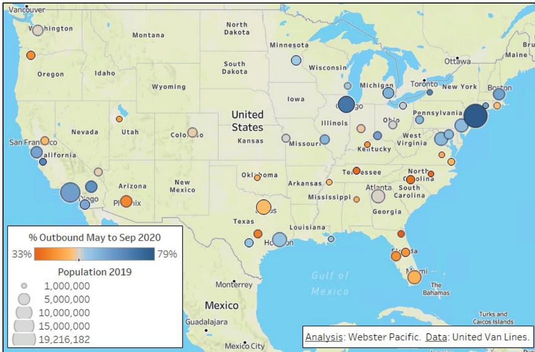
Map 2) Change in % Outbound, May to September 2019 to 2020 (Top 50 CBSA by Population):

People are moving out of the most populous metro areas (large, blue circles). Regionally, people are moving to the South and the Pacific Northwest (orange and red circles).